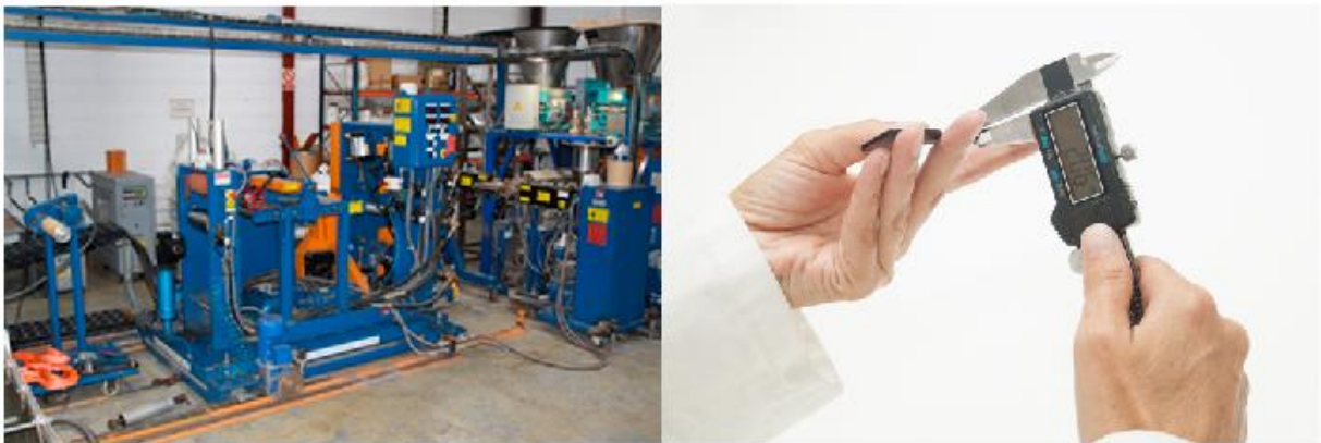
Figure 1: Atarfil Pilot machine

Since 1995, Atarfil has invested heavily in R&D, intent on establishing the best product to meet the environmental need of it's customers and ensuring that this process can be replicated by our factories around the globe. Atarfil has three GAI-LAP accredited laboratories with the latest testing technology, and a small-scale pilot flat-die geomembrane machine that allows the technical team to create and evaluate geomembranes with different resins and formulas without full-scale manufacturing trials. The future of Geomembranes is formula specific.