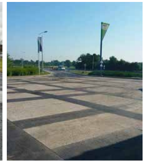
Pic. 13: Cement concrete joints