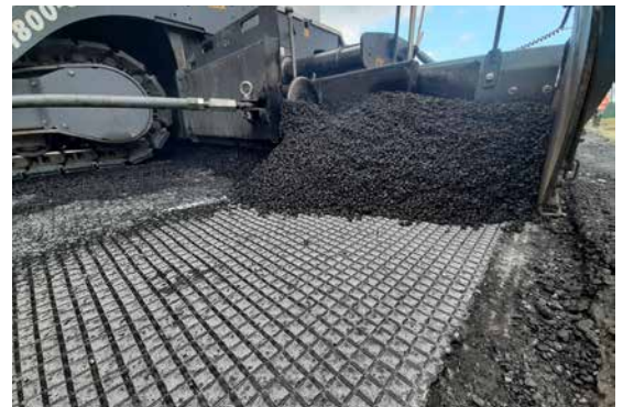
Pic. 17: HMA application over ADFORS GlasGrid Rapid