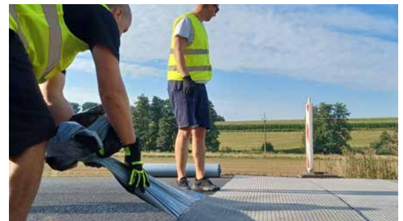
Pic. 7: Then take the foil off