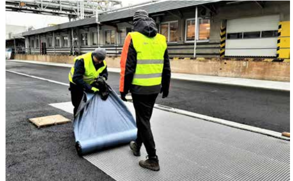
Pic. 4: ADFORS GlasGrid Rapid instalation