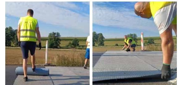
Pic. 5 - 6 : First unroll and adjust