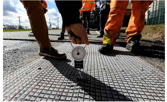
Pic. 16: Adhesion pull out test