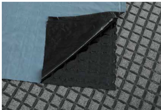
Pic. 1: ADFORS GlasGrid Rapid detail with protective film