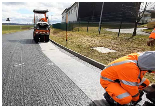
Pic. 3: ADFORS GlasGrid Rapid installation and adhesive layer activation