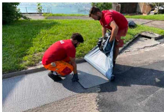
Pic. 2: ADFORS GlasGrid Rapid application for local repairs