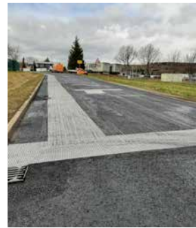
Pic. 12: Longitudinal & transverse cracking