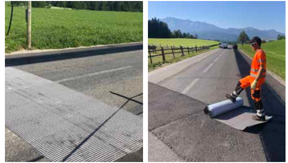
Pic. 10 & 11: Overlaps of reflective cracks