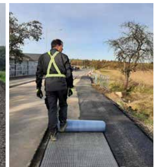
Pic. 9: Lane widening reinforceemnt