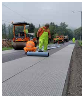
Pic. 8: Shoulder reinforcement