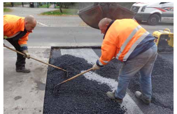
Pic. 18: HMA application over ADFORS GlasGrid Rapid