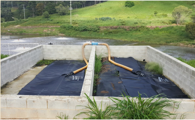
Small units with a footprint of 2.2 m x 7.6 m were used successfully to capture the solids in this waste stream.