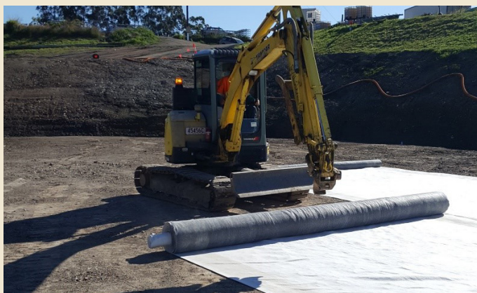
The Dewatering Cells were lined with Elcoseal X1000 Geosynthetic Clay Liner.