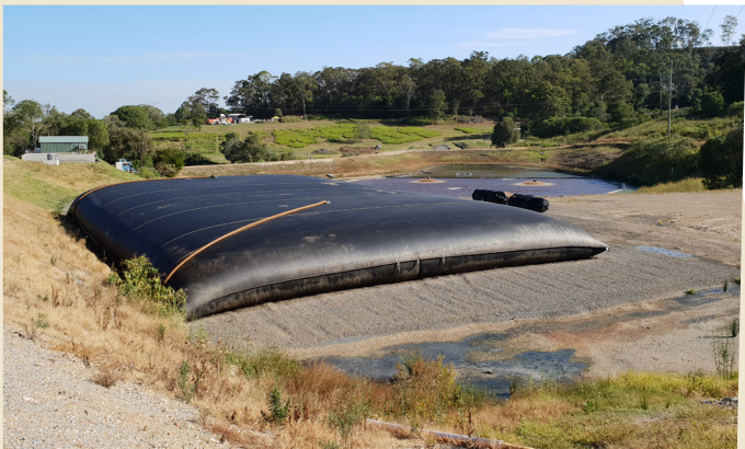
The 18.3 m x 30.6 m Geotube full in December 2018.